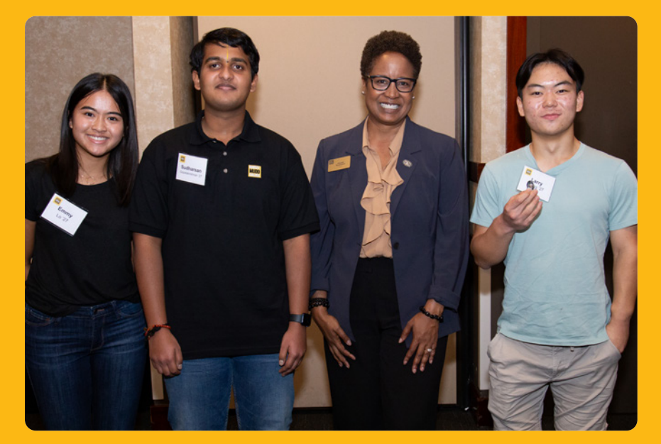
COMMUNITY CONNECTIONS, BAY AREA