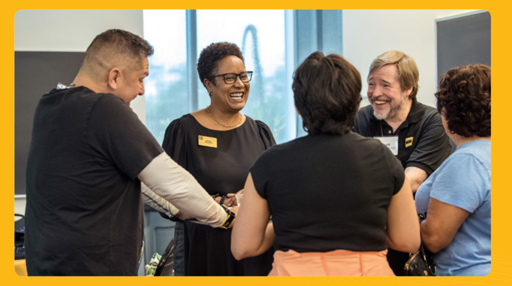
PARENT AND STUDENT WELCOME RECEPTION, CLAREMONT, CALIFORNIA