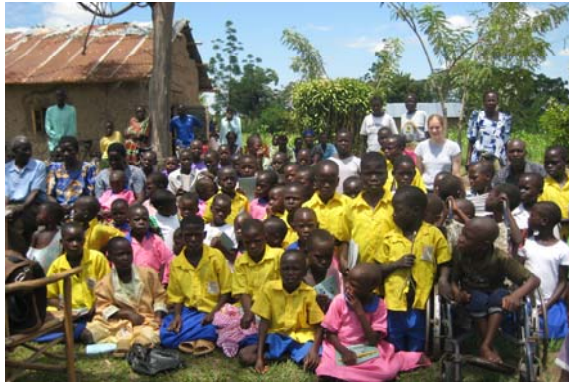
Orphans in a village near Tororo where we delivered uniforms and school supplies. The room where most of them attend school and church is shown in the upper left corner.