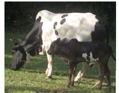
Cow and Calf