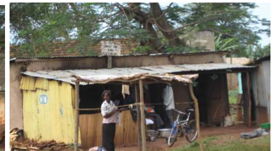
Two Popular Breakfast Destinations Near the Hospital: New World Hotel (left) and Christ the King Restaurant (right)