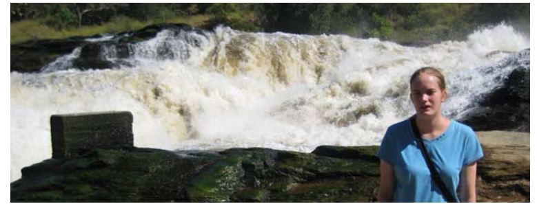
Hike to the Top of the Falls