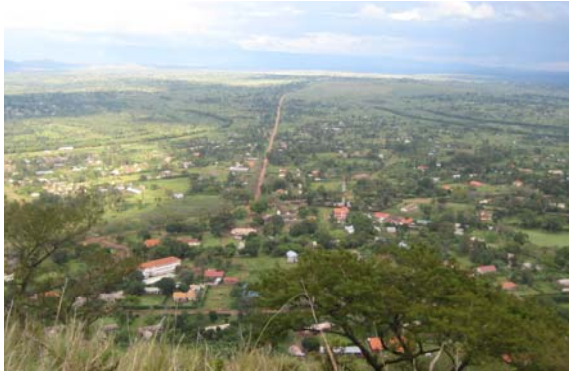
View of Tororo from the Top of Tororo Rock