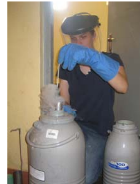
Liquid Nitrogen Sample Storage System