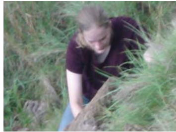
Climbing Tororo Rock