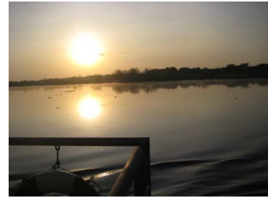
Sunrise on the Victoria Nile