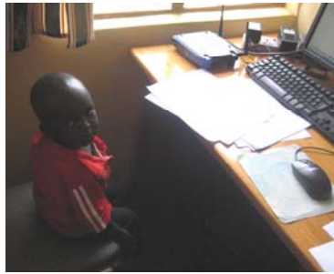
Our IT Consultant