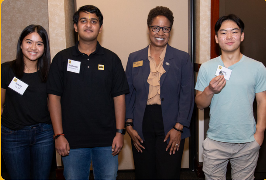
COMMUNITY CONNECTIONS, BAY AREA