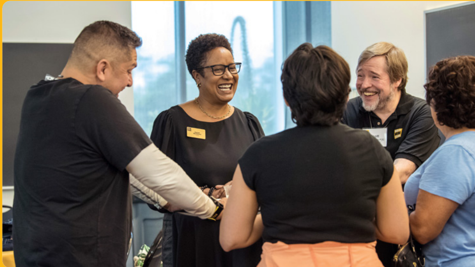
PARENT AND STUDENT WELCOME RECEPTION, CLAREMONT, CALIFORNIA