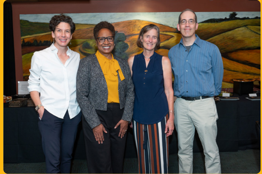
COMMUNITY CONNECTIONS, SEATTLE, WASHINGTON