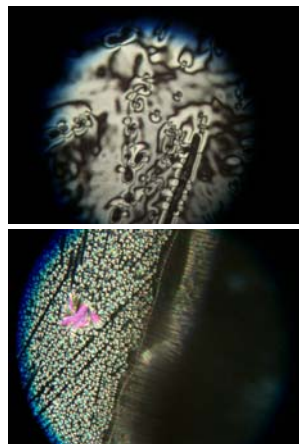
Photo microscopy pictures of a nematic liquid crystalline phase (top) displaying a schlieren texture, and the smectic A liquid crystalline phase (bottom) displaying both a focal conic texture, with a small patch of fan texture in its midst. These pictures were taken using the 7CB-8CB system at 0.6 mole fraction 7CB.

This extension of the nematic phase occurs when mixing the homolog that precurses the first smectogen in the series (7CB) with a smectogenic homolog (8CB). It would be interesting to continue studying 7CB binary mixtures with higher order smectic homologues in the series in order to see if there is a trend in the extension of the nematic phase region beyond the first smectogenic homolog.